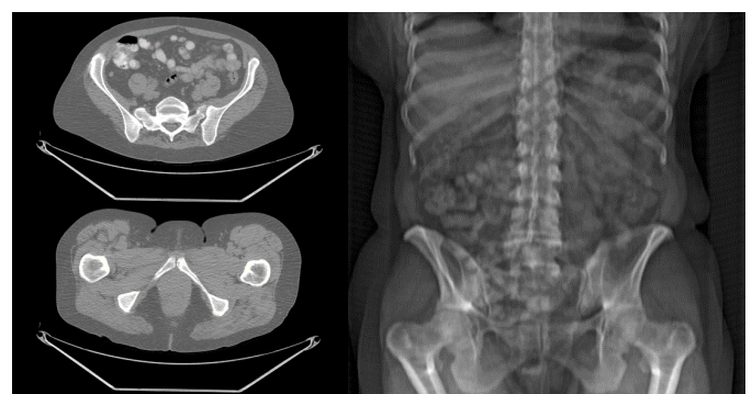
Left (top and bottom): CT Slices; Right: IBEX AX Synthetic X-ray