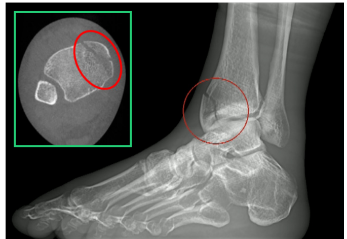
Main image: IBEX AX Synthetic X-ray; Inset: CBCT Slice

The software is provided as an SDK with full instructions and support for integration into the imaging pipeline of your system.