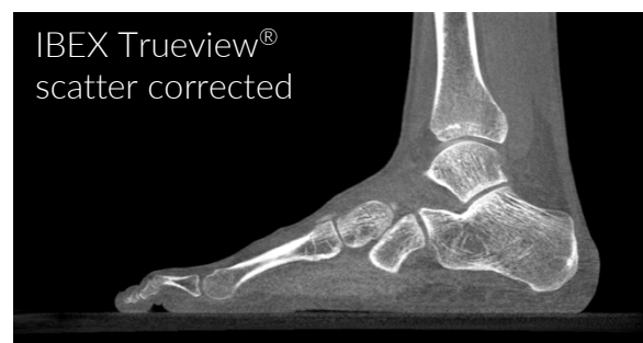
High resolution slices of a human foot in sagittal plane IBEX Trueview ® increases bone contrast by 37% and tissue contrast by 53%